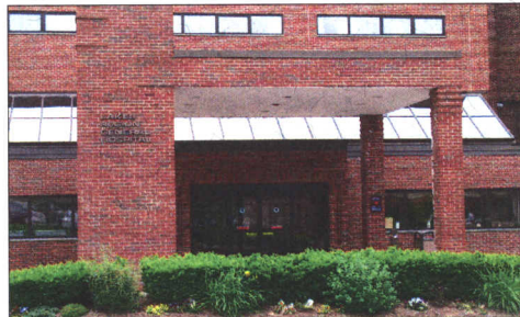
Lakes Region General Hospital Main Entrance